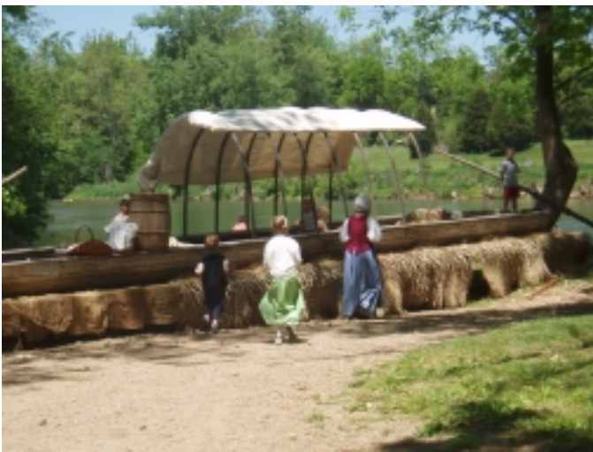
Captain Chuck's flat-bottomed boat in Port, May 20, 2006

All of us counted this day a success! An interested, and interesting, crowd of people made their way to Port Republic on May 20 to celebrate the history of the River and learn more about its critical health problem. A guided walking tour illustrated the role of the rivers in the history of the town and many visited the Museum.